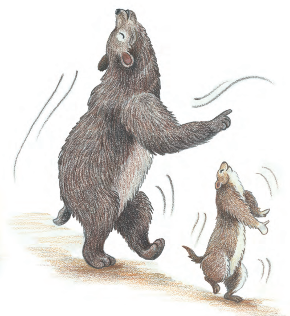
"Stomp with the drums."