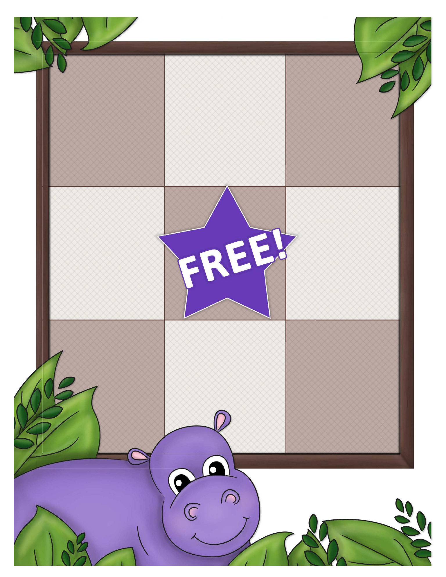
Phonogram Jungle Bingo