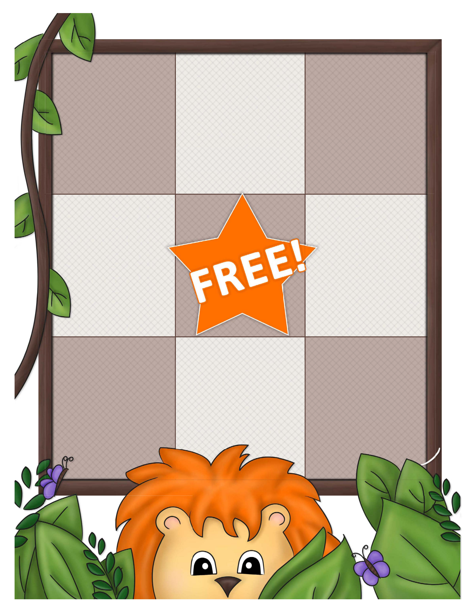
Phonogram Jungle Bingo

© 2017, 2007 by All About® Learning Press, Inc.