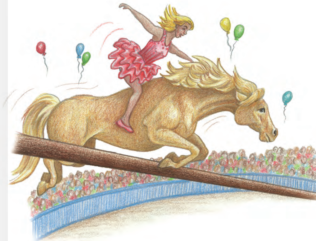
Mel and Flash jump!