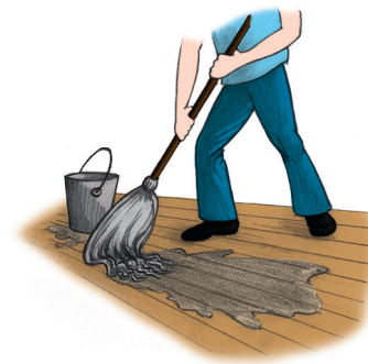
swab the decks