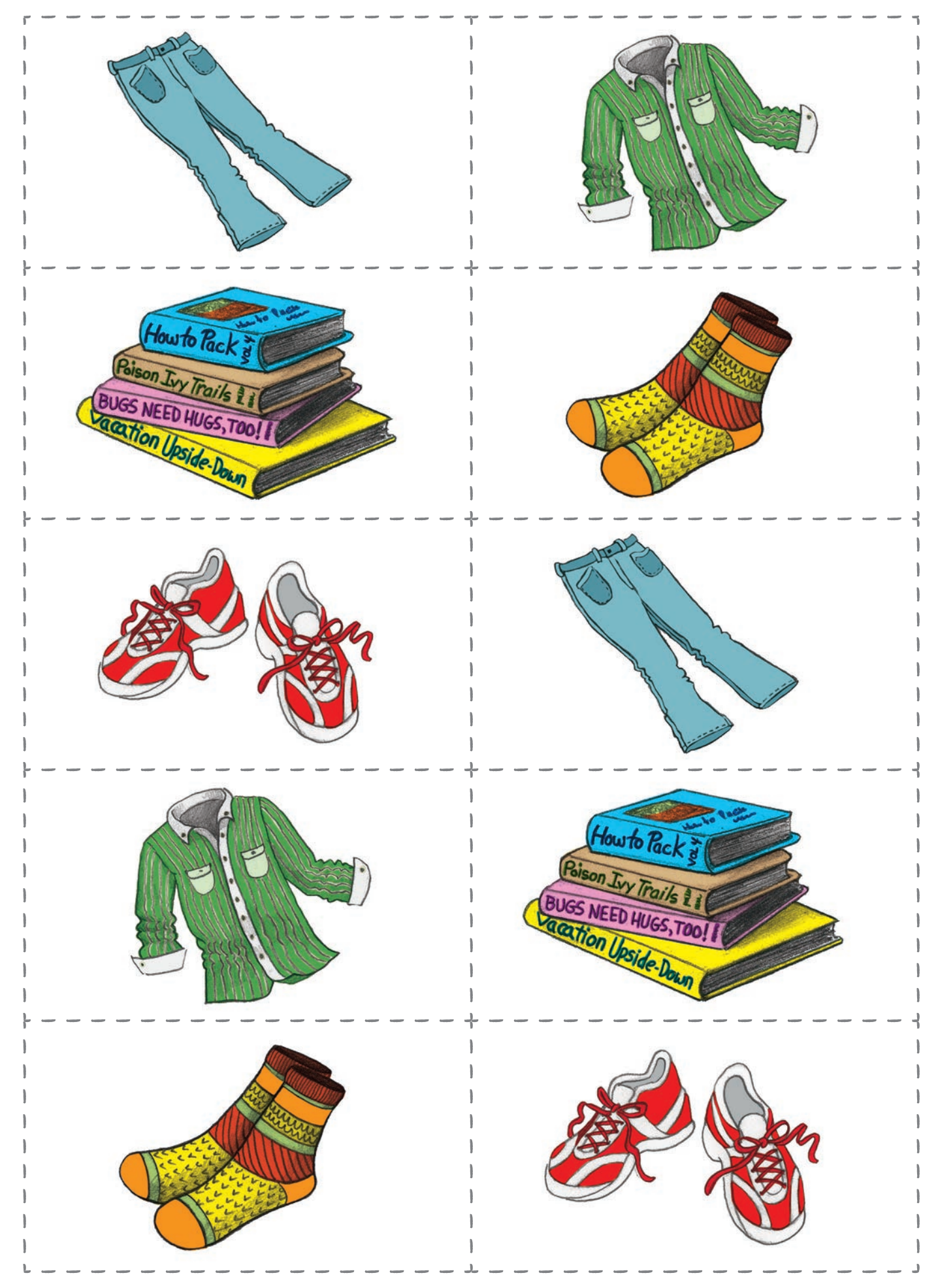
© 2018, 2015 by All About®Learning Press, Inc.